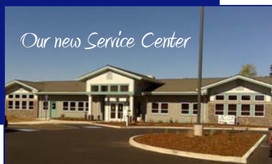
Our new Service Center

52,312 of your neighbors were helped by UCAN in Douglas and Josephine counties during 2007 - 2008.