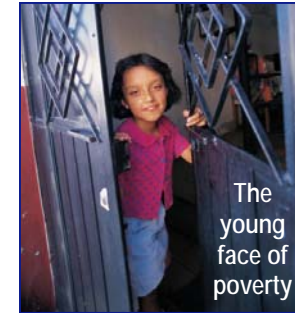
The young face of poverty

These past two months, the line in Grants Pass has included families, working people, seniors and the disabled. It is truly a